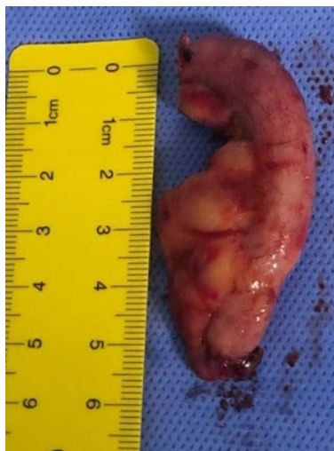
Figure 1: features the removed appendix from the patient's abdomen.