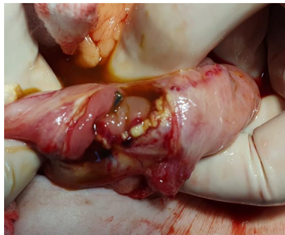
Figure 2: Intra-operative photo showing the transmural tear of the cecal wall.

A few minutes before the surgical incision was made, the patient developed bradycardia that progressed to cardiac arrest. Cardiopulmonary resuscitation was immediately initiated, with a return of pulse and a blood pressure of 70/40 mm hg. Decompressive crush laparotomy was done, with the findings of a large amount of free air in the peritoneal cavity, a transmural tear of 2 cm at the antero-medial wall of the cecum (Figure 2) and a longitudinal serosal tear along the anterior wall of the ascending colon. An abbreviated laparotomy with right hemicolectomy and temporary closure of the abdomen was completed. Despite these efforts, the patient's vital signs and arterial blood gases did not improve. The patient was transferred to the Intensive Care Unit, hemodynamically unstable, for further management. Several hours following the surgery, despite maximal vasoactive treatment, the patient was in severe shock with multi-organ failure, and died 6 hours following admission.