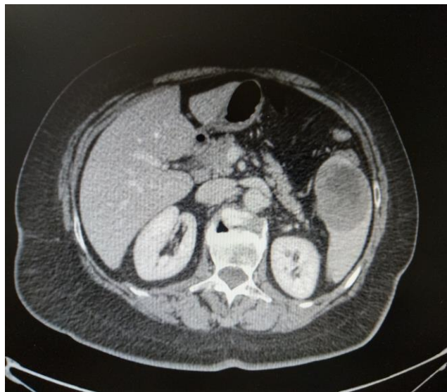
Figure 1: Abdominal computed tomography (CT). CT scan shows a large not homogeneously hypodense formation localized in the lower third of the spleen of 60x59 mm with extracapsular involvement at the medial margin

aspartate aminotransferase [AST] 102 U/l), and severe pain of the lower extremities due to worsening of a coxofemoral arthrosis). She performed a further PET scanning which just showed an aspecific increase in metabolic activity affecting the coxofemoral and glenohumeral joints and as suggested from our surgeon, she completed surgical procedures with a laparoscopic hysterectomy and total omentectomy. Histopathological examination of this surgery did not reveal the presence of tumor cells. Currently, Ca 15.3 is still normal and the patient is carefully monitored with follow-up visits and radiological controls.