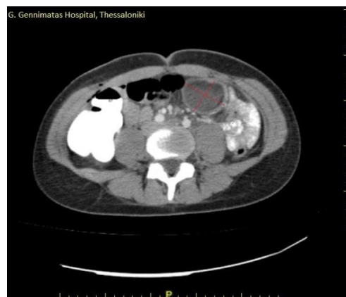
Figure 2: Computed tomography of the abdomen showed a 5.5 \times 5.1 , well-defined, multi-dense cystic lesion.