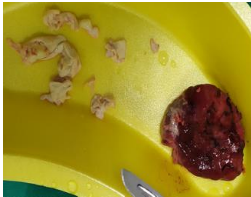
Figure 3b: Intraoperative findings. The resected mesenteric cyst.