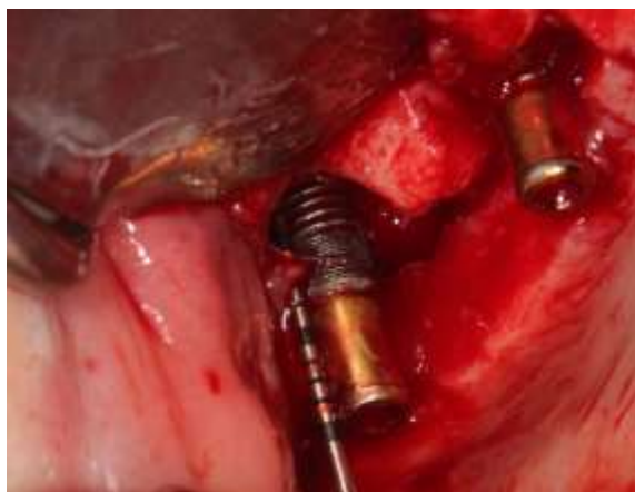
Figure 7: #5 implant demonstrating significant circumferential crater defects with greater than 50% bone loss and communication with right maxillary sinus.