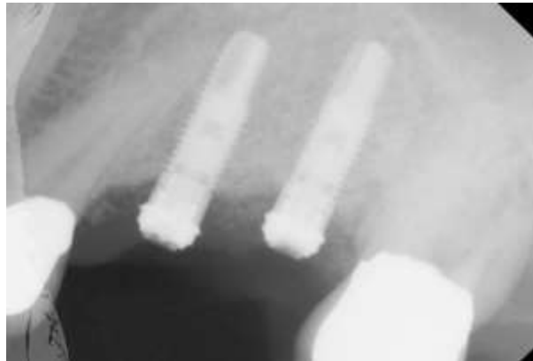
Figure 4: Radiograph during COVID-19 pandemic, of fractured abutment screws and fractured implant abutments.