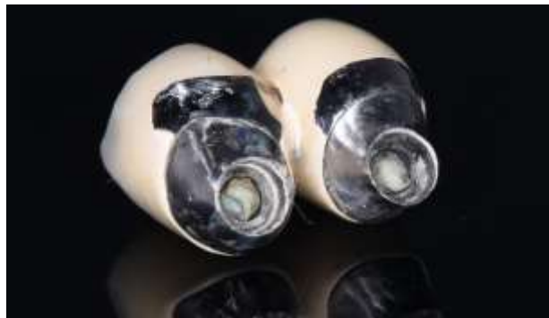
Figure 5: Fractured custom abutments are retained inside of splinted PFM restorations.