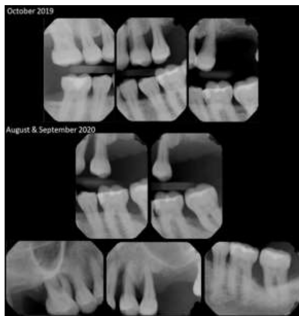
Figure 1a (top): Radiographs of initial presentation (October 2019) with generalized horizontal attachment loss and localized 5-6mm pocket depth.

and fractured implant abutments dislodged inside of the cemented restorations (Figures 4, 5). Patient denied wearing an occlusal splint.