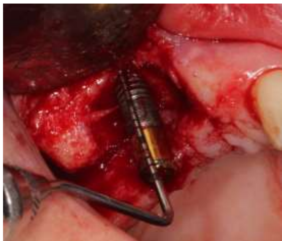
Figure 6: #4 implant demonstrating significant circumferential crater defects with greater than 50% bone loss.

screw-retained prosthesis, and delivery of an occlusal splint. As the patient did not undergo any known changes in his health history, we considered the heightened stress during the pandemic as a possible contributing factor to his prosthetic complication.