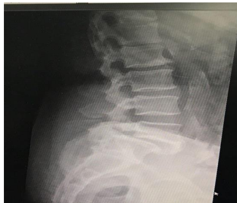
Figure 4: Case 3, spondylotic change at L5/S1.