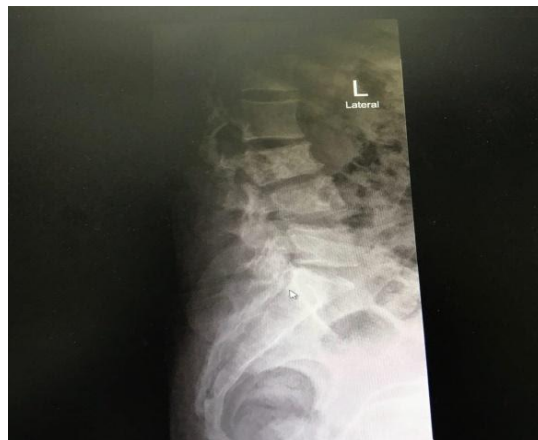
Figure 1: Case1, x ray showed osteolytic lesion L3,4.

A 27-year-old Arab male patient presented with non-traumatic LBP during the first visit for which he received a pain killer. During the second visit, he presented with non-traumatic LBP accompanied by repeated vomiting. He showed signs of dehydration and was sent to the observation room for rehydration and blood investigation. The patient experienced sudden disturbance in consciousness and was intubated. CT scan of the head showed intraventricular hemorrhage (Figure 6). He then underwent ventriculostomy and was transferred to the ICU and survived.