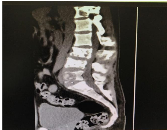
Figure 2: Case 1, MRI: showed metastasis on lumbar vertebra.