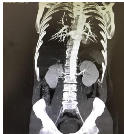
Figure 5: Case 4, C T showed distal aortic occlusion at the site of bifurcation and common iliac arteries.