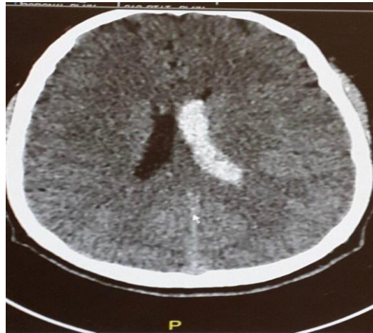
Figure 6: Case 5, CT brain showed inter ventricular hemorrhage.