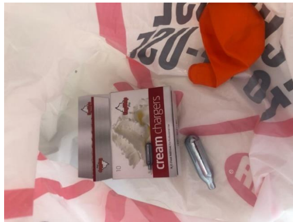
Figure 2: Nitrous oxide canisters (bottom) and balloon (top) found from patient's Belongings.

Transthoracic echocardiogram suggested normal chamber sizes and ventricular function. Autoimmune screening was negative. Hepatitis and HIV screening tests were negative. Urine drug screen for amphetamines, benzodiazepines, marijuana, cocaine, and methadone was also negative. While she was in the Intensive Care Unit (ICU), a collateral history from family and friends suggested she had appeared frequently dazed and vague in the weeks prior. A search of the patient's belongings (with the family's consent) revealed that she had been using nangs prior to admission. The nitrous oxide was being inhaled via balloons as well as directly from the nozzle of a whipped cream dispenser (see Figures 2 and 3). The box of 10 canisters in her bag had only one nang left.