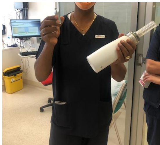
Figure 3: Nitrous oxide canister (left) and Whipped cream dispenser (right) found from patient's belongings.