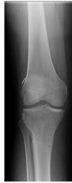
Figure 2: AP radiograph of ACL reconstruction with hybrid graft.