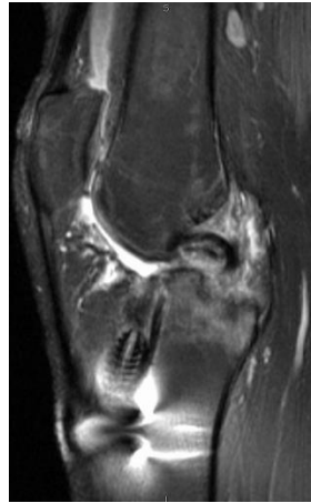
Figure 4: MRI of a failed hybrid ACL reconstruction.