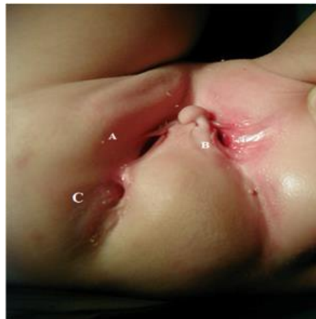
Figure 2: Showing two vaginal openings (A, B), anus (C).

At the age of 3, the child was admitted in our clinic. During physical examination, we found that she had two uteri and two cervixes with two separate vaginas. She passed urine from both urethras inside vaginal openings. Cystoscopic examination under anesthesia revealed a normal vagina, urethra, ureteric orifice, and