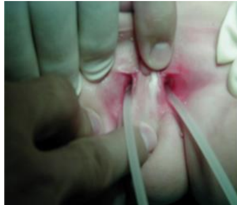
Figure 1: Double vaginal orificies.

Because of the coprostasis (the impaction of feces in the intestine), the perineal dissection of the ectopic anus by the cutback procedure was performed according to the A. Pena schedule, bougie dilation technique of anus using “Hegar Dilatators”.