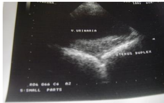
Pelvic ultrasound examination revealed bicornuate uterus (Figure 3).