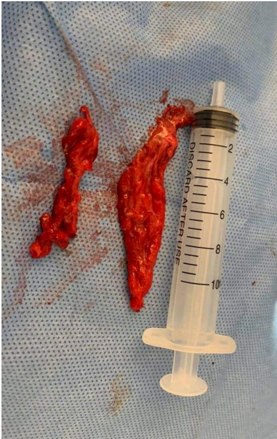
Figure 1: Bronchial muco-hematic plugs

the cast was finally removed with the help of a respiratory physiotherapist. Microscopic examination of this tissue revealed a muco-hematic plug, infiltrated by neutrophils, bronchial epithelial cells and bacteria (Figure 2).