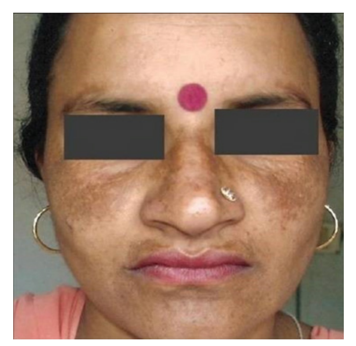
Figure 1: Centro-facial pattern Origin [6].

Melasma is usually classified into 3 histological patterns depending on where the melanin pigment is found: epidermal, dermal, and mixed [10]. The epidermal form, in which melanin is dispersed throughout the epidermis, is the most common. The upper and mid dermis are involved in the dermal type. Many pigment-laden macrophages in the dermis are related to the pigmentation. Both epidermal melanin pigment and dermal melanophages are increased in the mixed type.