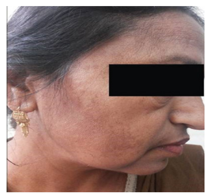
Figure 3: Mandibular pattern Origin [8].