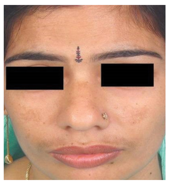
Figure 2: Malar Pattern Origin [7].