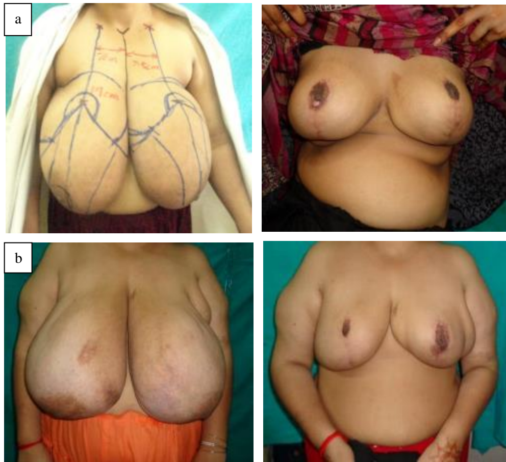
Figure 2: Pre and post op outcomes of two of our patients with gigantomastia.