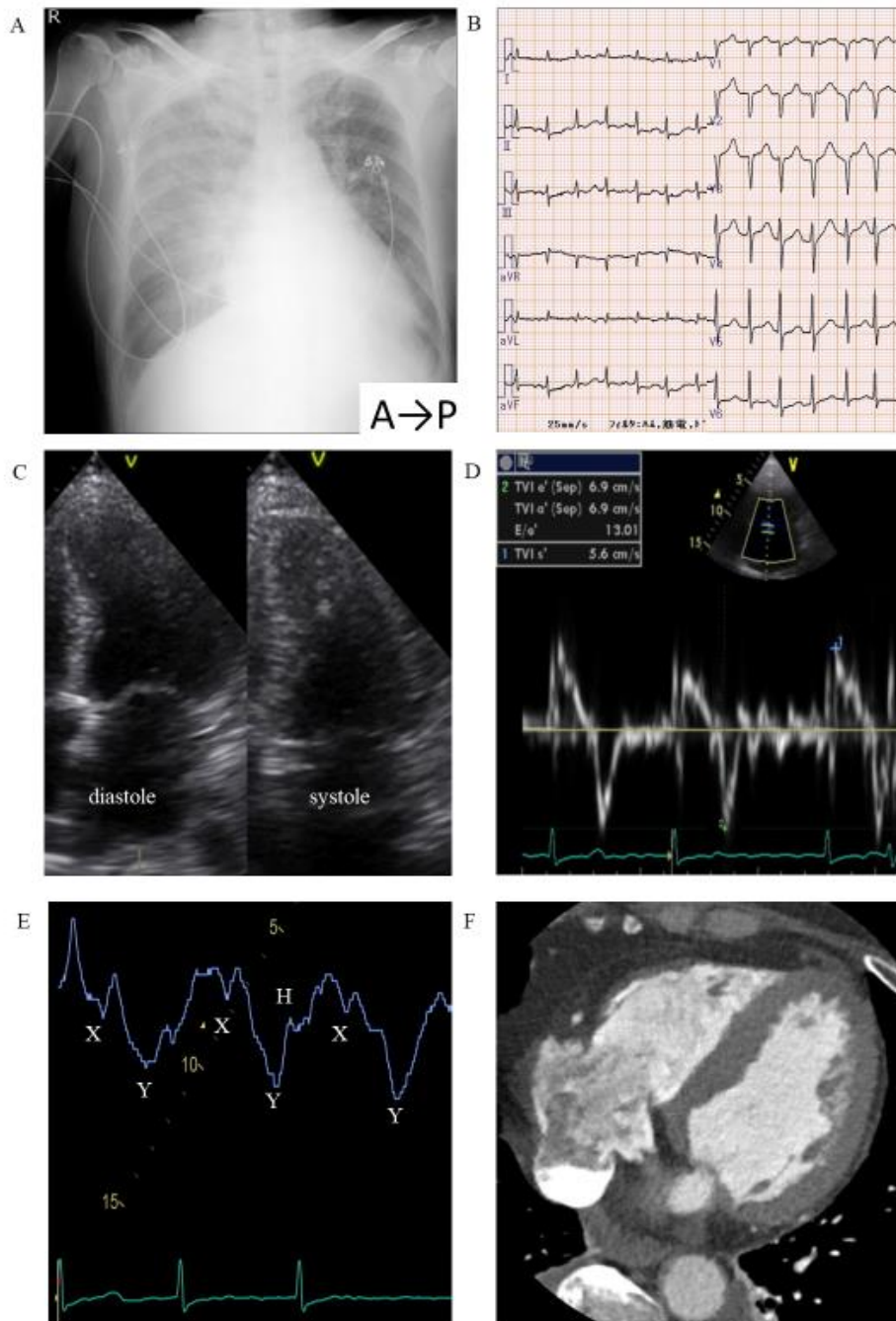
Figure 1: Examinations performed during admission. A; Chest X-ray, B; electrocardiogram, and C; echocardiography on admission. D; Mitral septal e' and E; jugular venous pulse on day 4 of admission. F; Computed tomography on day 5 of admission.

ms), and her jugular venous waveform presented the less-distensible right ventricle pattern i.e., dominant ‘Y’ descent deeper than the ‘X’ descent (Figure 2C, middle and lower).