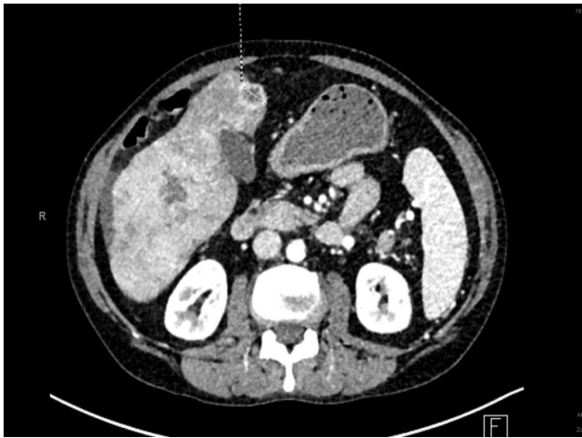
Figure 2: Abdominal CT showing hepatocellular carcinoma

chemotherapy and recommended a palliative treatment with immunotherapy. Unfortunately, immunotherapy was complicated, treatment had to be stopped and patient died within 10 weeks. During his follow up the patient presented no clinical symptoms of chronic heart failure (CHF) and was monitored with regular blood tests and echocardiography. He presented at 26 years old a baffle stenosis treated by balloon dilatation 12 years later. Despite the baffle dilatation, high pressure of 16 mmHg persists in the inferior vena cava (IVC). He also presented a right heart dysfunction evaluated by MRI at 37%. At this time, we recorded no hepatic cytotoxicity. Three years later, the patient had an baffle restenosis and two endovascular stents were inserted (Figure 1). IVC pressure post procedure was still 15 mmHg but no hepatic veins dilatation was noted. Patient had a monochamber pace maker implantation at age 45 due to sinus dysfunction. From his 45 to his 50 years old serial echocardiography data showed