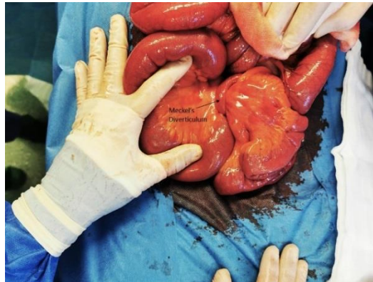
Figure 3: The small bowel loop that slung over the diverticulum.

The patient was discharged on post-operative day 3 without any complications. Pathology findings indicated diverticulitis without any pancreatic or gastric metaplasia.