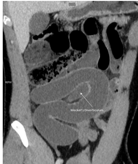
Figure 1: CT scan, sagittal plane.

to different Emergency Rooms, with no diagnosis whatsoever. The patient's abdomen was tender and distended, with a positive Blumberg sign. The bowel sounds were slightly hyperactive. His body temperature was 36.6°C. Laboratory tests showed leucocytosis 19 910/ \mu l, C-Reactive Protein 10.65 mg/l, Creatinine 1 mg/dl, Haemoglobin 17.7 g/dl and Haematocrit 50.6%. The abdominal X-ray indicated air-fluid levels and a suspicion of a GI tract perforation in the right abdomen. Because of a nonspecific image a CT scan was performed – it showed the characteristics of a subileus, with necking on the level of small intestine (Figure 1 and 2).