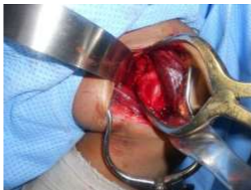
Image E: Visualization of glenoid and identification of anteroinferior labral avulsion.