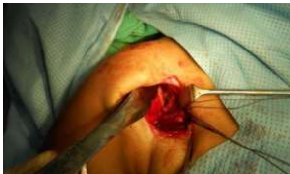
Image G: Repaired anteroinferior capsulolabral tissue.

The anteroinferior capsulolabrum was elevated using arthroscopic elevator and the underlying bone rasped using the arthroscopic rasp. Next, the repair was done using metallic anchors, Titanium (Biotek mini vim 2.8