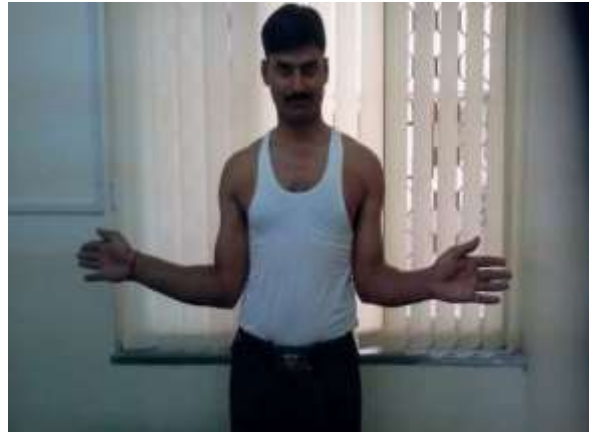
Image J: Postop evaluation: comparing loss of external rotation with contralateral shoulder.