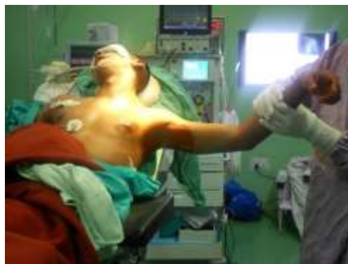
Image B: Positioning of the patient in Beach Chair with GA and interscalene block.

axillary nerve. The subscapularis was incised in a L shaped incision at about 1 cm from its humeral insertion or split in line of its fibres at the junction of upper 2/3rd and lower 1/3rd, depending on surgeon preference (See Image D). A blunt gelpi's self-retaining retractor was put to dissect anterior glenohumeral capsule. Some surgeons preferred to put stay sutures in before incising Subscapularis.