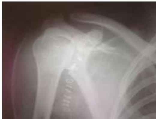
Image H: Post op X ray with suture anchors in the anteroinferior edge of glenoid.

to its humeral component. In a L-shaped incision, it was repaired and if Subscapularis was split, it was stitched. The subscapularis repair was completed using no. 2 ethibond along with Rotator interval closure. Post operatively, patients were rehabilitated for the operated shoulder as per open bankart protocol. All patients were followed up at intervals of 2 months, 6 months , 1 year and 3 years post op as they had to come to the institute or affiliated hospitals for medical categorization.