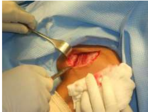
Image C: Approach- Deltopectoral with identification of Cephalic vein.