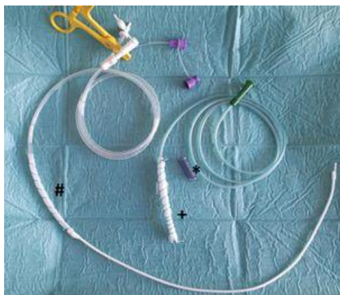
Figure 3: Image of the endobronchial stent (*) and an open-pore film drainage on a naso-gastric tube for the mediastinal cave (+) and an open-pore film drainage on a triluminal tube (#) for the gastric suction (ventilation tube is closed with a yellow clamp) and jejunal feeding.

Fifth step included an endobronchial stenting with removal of the esophageal SEMS. ENPT with OFD in mediastinal position and active gastral fluid removal with the wrapped feeding tube were continued.