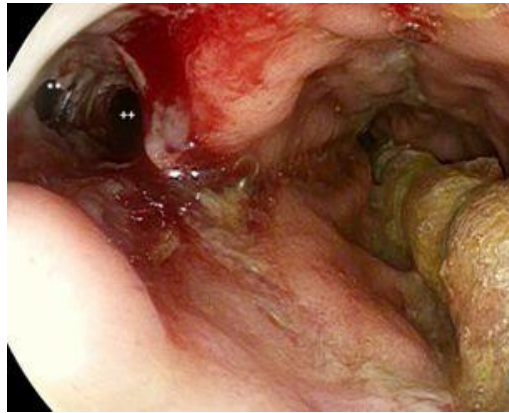
Figure 4: Endoscopic image of the anastomotic region with the bronchial fistula (**), and a view into the mediastinal cave (++), into the gastric lumen is a wrapped tube positioned for endoluminal negative pressure therapy.