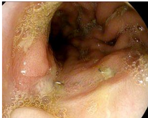
Figure 5: Endoscopic finding of the anastomotic region with completely healed insufficiency.

The fifth treatment concept was maintained for four weeks. Removal of the mediastinal tube was done after two weeks because of good wound cleaning and decreased wound size. Patient recovered completely from the anastomotic insufficiency and the bronchial fistula. Bronchial stent was removed after 4 weeks. Patient could be discharged 12 weeks after oncological resection, 11 weeks after primary detection of an intrathoracic anastomotic insufficiency and 8 weeks after primary detection of an esophago-bronchial fistula. To treat this patient was an interdisciplinary maximum performance. In addition patient developed an anastomotic stricture. At the moment he is treated with endoscopic dilatation interventions every two weeks. No tumor recurrence is detected up to now.