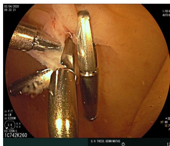
Figure 3: Immediate hemostasis using hemoclips.