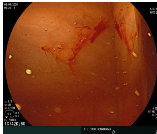
Figure 1: A DL on the distal ileum.