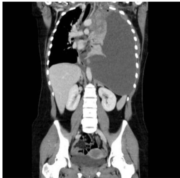
Figure 2: Coronal reformatted contrast-enhanced thoraco-abdomino-pelvic CT image shows: an anterior mediastinic solid mass (78 × 94 × 121mm), with heterogeneous enhancement, lobulated contours, without fat or calcifications, encircling the aortic arch and abutting the pericardium; left lung atelectasis and massive pleural effusion, occupying the entire left hemithorax with contralateral mediastinal shift.