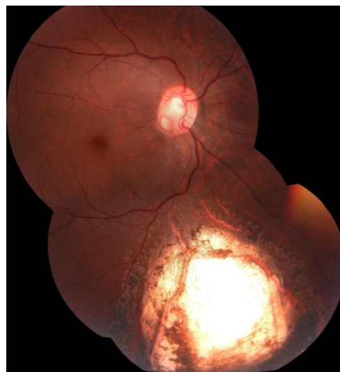
Figure 1: Right eye fundus photo showing chorioretinal coloboma and optic disc pit.