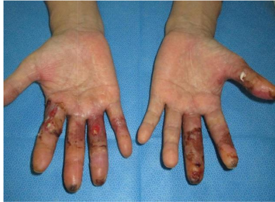
Figure 1: The patient’s hands injured by high-voltage electricity (before skin graft surgery).