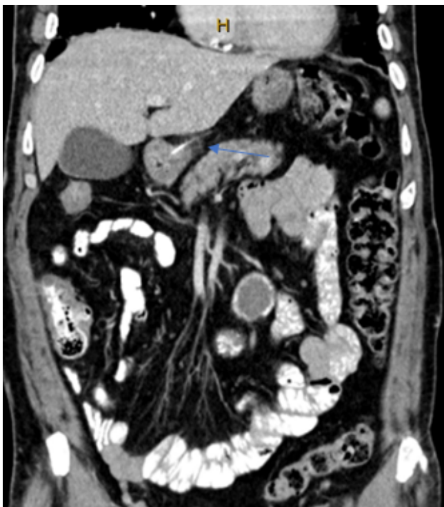
Figure 2: Coronal contrast enhanced CT image of Patient Two demonstrating hyperdense curvilinear foreign body penetrating the pylorus (arrow).