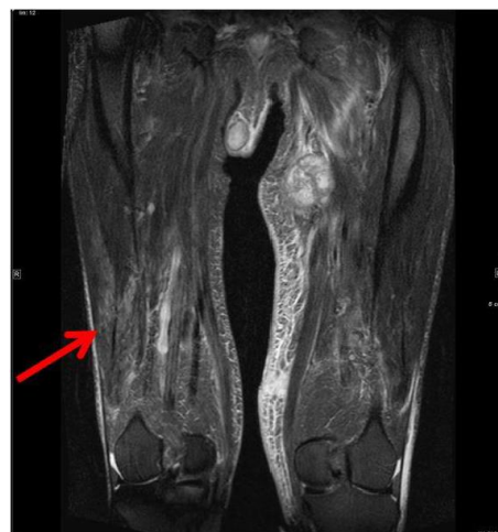
Figure 3: MRI scan of the lower extremities showing T2-hyperintense changes of vastus lateralis and intermedius muscle due to myositis.