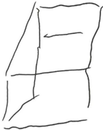
Figure 2: The Necker cube copying task.