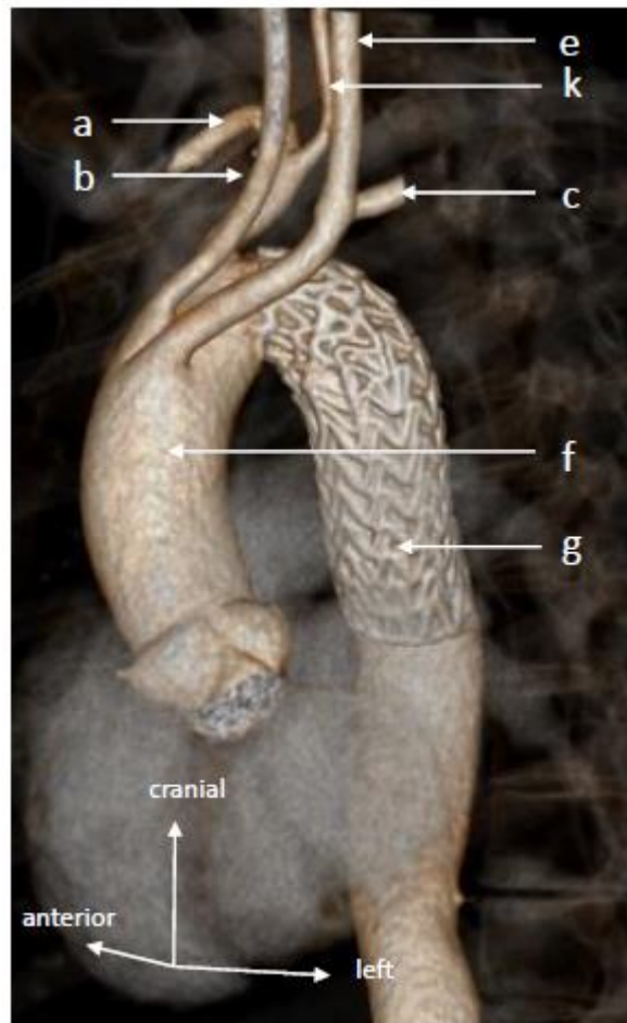
Figure 2: 3-Dimensional reconstruction of CT angiography of the aorta at 3 months: a, b, c, e, f, g described on Figure 1 legends; k: right vertebral artery.

CT angiography showing : f : ascending aorta, g : descending right sided aorta, h : azygos vein, i : esophagus, d : kommerell’s diverticulum. C: Axial section of lymphangio-MRI showing the thoracic duct (j). D: Axial section of CT angiography showing the diverticulum after the first endoprosthesis (d). CT, chest tomography; MRI, magnetic resonance imaging.