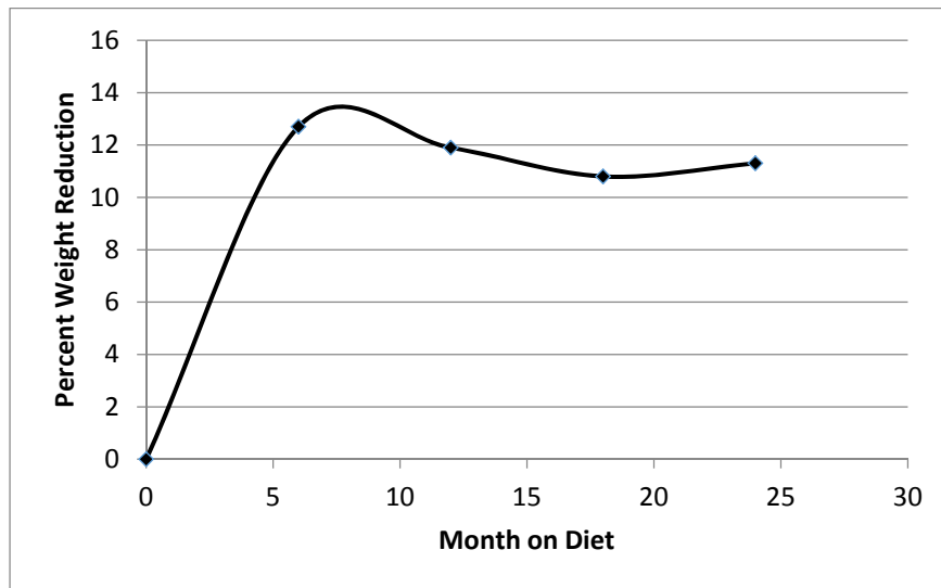
Figure 2: Average Percentage of Weight Reduction during the Course of Dieting.