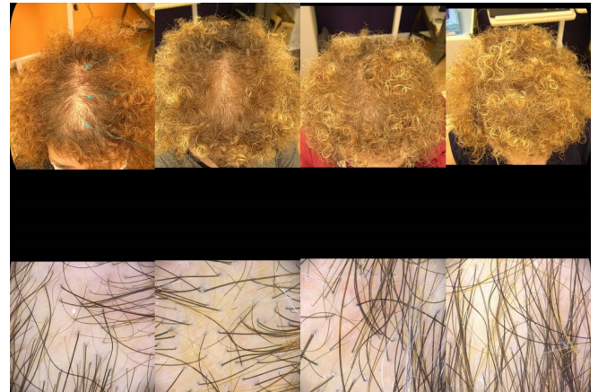
Figure 5: Trichoscopy as a diagnostic and monitoring tool in hair loss diseases. From Left to Right: Clinical and trichoscopic findings before the SEFFIHAIR™ and TRICHOBIOLOGIHT® treatment (T0) (Second images): Clinical and trichoscopic findings after one session of SEFFIHAIR™ and two sessions of TRICHOBIOLOGIHT® (T2). A consistent thickening of hairs (variation in hair shaft diameter is >35%) is observed, while there is no change in the number of follicular units with single and multiple hairs and perifollicular halo. (Third Images): Clinical and trichoscopic findings after one session of SEFFIHAIR™ and four TRICHOBIOLOGIHT® treatment (T4). (Fourth Images): Clinical and trichoscopic findings after one session of SEFFIHAIR™ and six TRICHOBIOLOGIHT® treatment, one month of follow up at the end of the treatment (T7) in a 55-year-old woman.