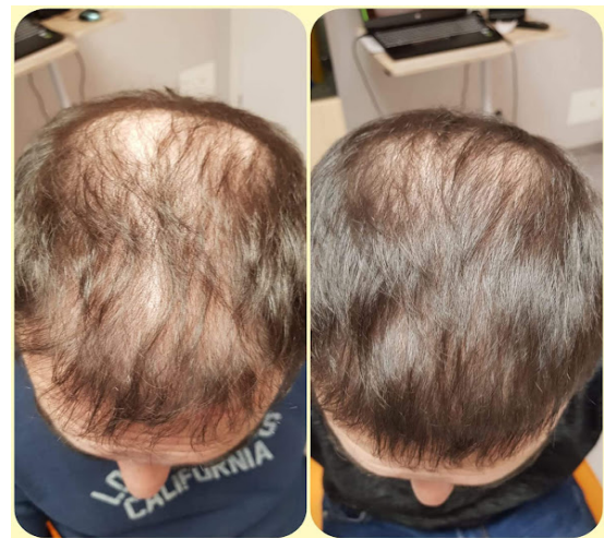
Figure 6: Excellent outcome after one session of SEFFIHAIR™ and 6 TRICHOBIOLOGIHT® sessions in a 35-year-old man.

self-resolving within 24-hour. At the end-of-treatment satisfaction questionnaire, 97,5% (39/40) of patients reported a high satisfaction with the treatment, referring to the better perception of their image for a visible increase in thickness and shine of the hair, associated with a decrease in hair loss.