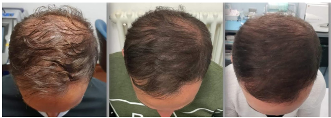
Figure 3: Excellent improvement after one session of SEFFIHAIR™ and 6 TRICHOBIOLOGIHT® sessions, with a consistent thickening of the patient's hair in a 46-year old man.