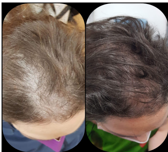
Figure 4: Excellent improvement after one session of SEFFIHAIR™ and 6 TRICHOBIOLOGIHT® sessions, with a consistent thickening of the patient's hair in a 38-year-old man.