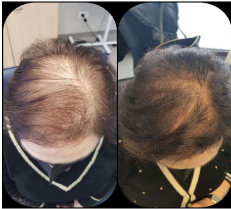
Figure 7: Good outcome after one session of SEFFIHAIR™ and 4 TRICHIOBIOLIGHT® sessions in a 49-year old woman.