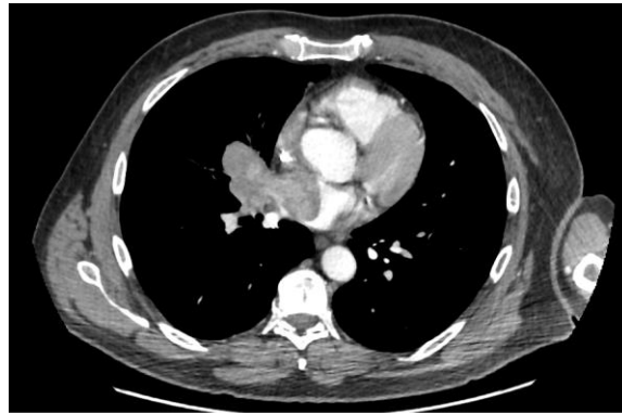
Figure 1A: occurrence of a bulky intracardiac metastasis or RCC in February 2016.

subsequent to the surgery, an acute promyelocytic leukemia with translocation between chromosome 15 and 17 was diagnosed. A specific treatment was started and nivolumab was not reintroduced. In March 2018, complete remission of the leukemia with negative minimal residual disease was achieved (Figure 3). After twenty-one months of nivolumab interruption, in March 2019, the dramatic efficacy on the intra cardiac metastasis (Figure 1C) and nephrectomy lodge (Figure 2B) was still maintained.