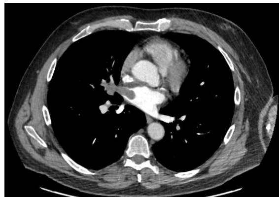
Figure 1B : Dramatic response in December 2016.