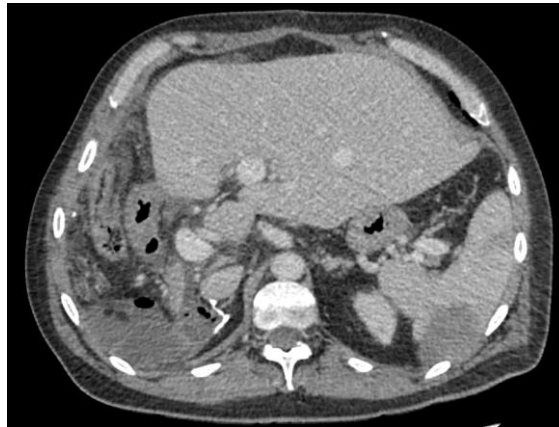
Figure 2A: Nephrectomy site recurrence associated with colic contiguity invasion in July 2017.