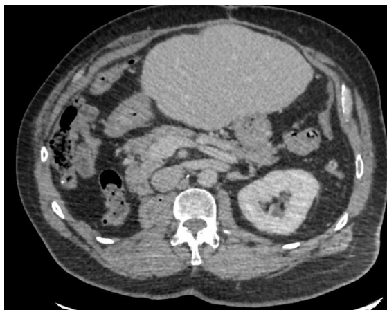
Figure 2B: No recurrence in March 2019.