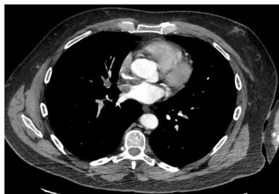
Figure 1C: Prolonged response with intra cardiac metastasis in March 2019.